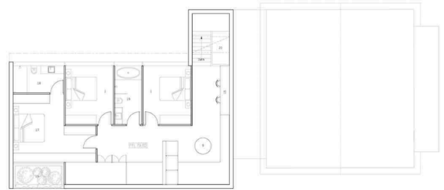
FIRST FLOOR PLAN - scale 1:100